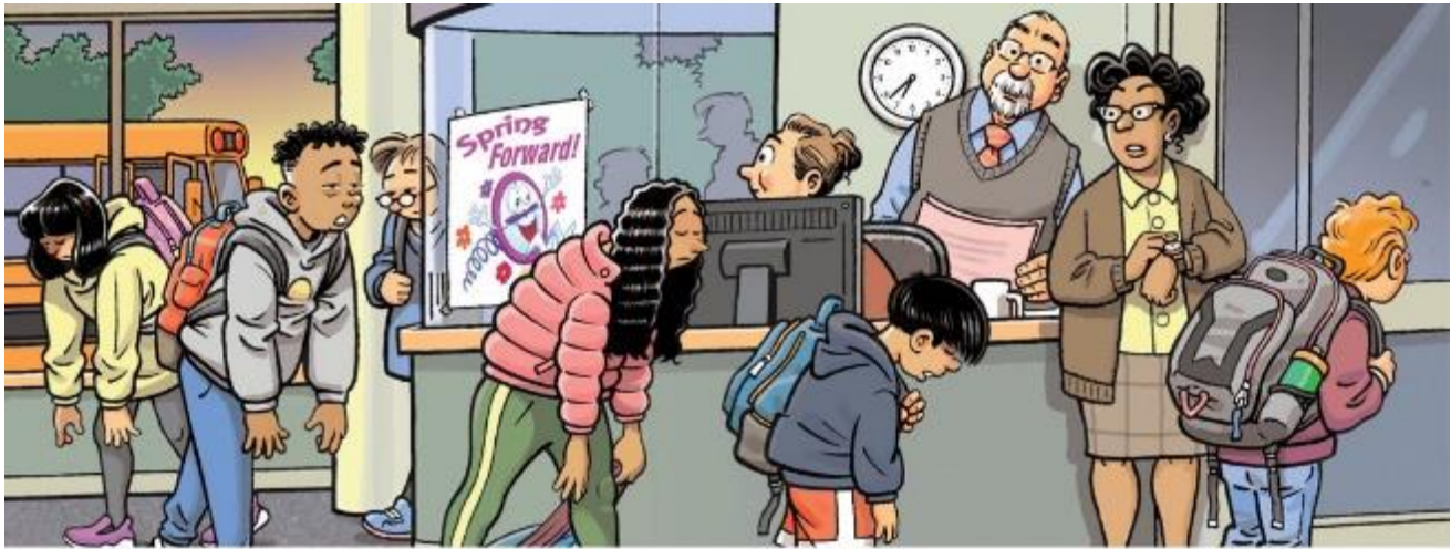
"ZOMBIES? NO, IT'S THE FIRST MORNING OF DAYLIGHT SAVING TIME."

Sleep allows your neurons, or nerve cells, to reorganize. When you sleep, your brain's glymphatic (waste clearance) system clears out waste from the central nervous system. It removes toxic byproducts from your brain, which build up throughout the day. This allows your brain to work well when you wake up.